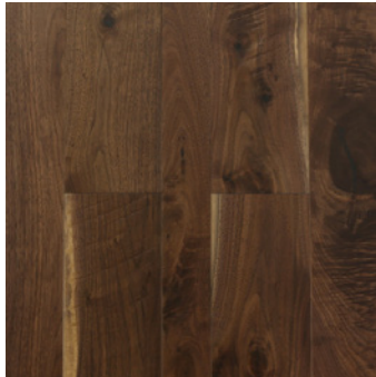
Water-based Polyurethane Pre-finish

Long prized as a premium hardwood for furniture, Gunstock Walnut’s exceptional, purple-tinged chocolate hues will help you create a one-of-a-kind room with an historic touch. This traditional flooring is manufactured without steaming to preserve light sapwood accents and create a natural, one-of-a-kind sheen. Gunstock Walnut’s strength and beauty will last a lifetime and beyond.