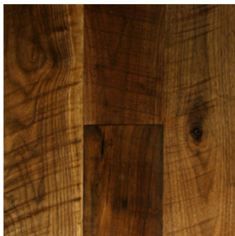
Oil-based Polyurethane On-Site Finish