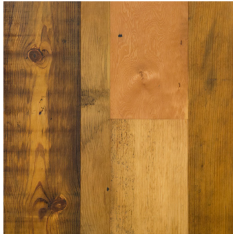
Water-based Polyurethane Prefinish