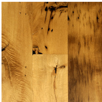
Oil-based Polyurethane On-Site Finish