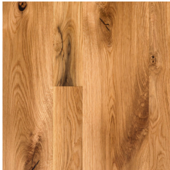
Natural Oil Pre-finish