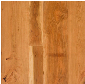
Natural Oil Pre-finish