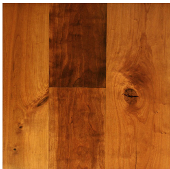
Oil-based Polyurethane On-Site Finish