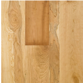
Water-based Polyurethane Pre-finish