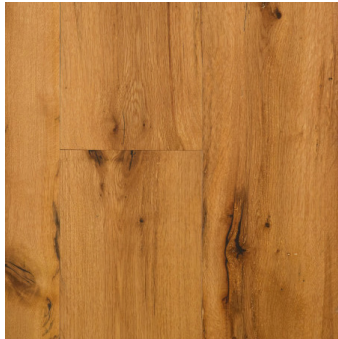
Water-based Polyurethane Prefinish