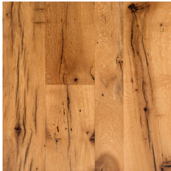
Natural Oil Prefinish